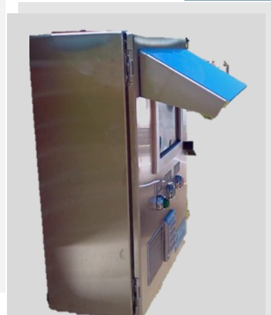
Optional Sun Shield

With a simple interface, customers are prompted to enter their account number, followed by a PIN code. They can then initiate the flow of their pre-purchased water and stop delivery on command. The easy to read interface details how much water is being distributed and any remaining balance. This information (depending on options) is accessible via a host computer. The H2O Client is the most important piece of any bulk water distribution puzzle.