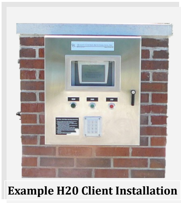
Example H2O Client Installation

Compatible with any Windows-based PC, the H2O Client is the solution for bulk water distribution systems. Built to be an efficient and profitable means for distributing and vending bulk water, the H2O Client performs this function with ease. Selling bulk water to contractors, other cities, individual commercial or industrial interests, opens new doors for generating revenue.